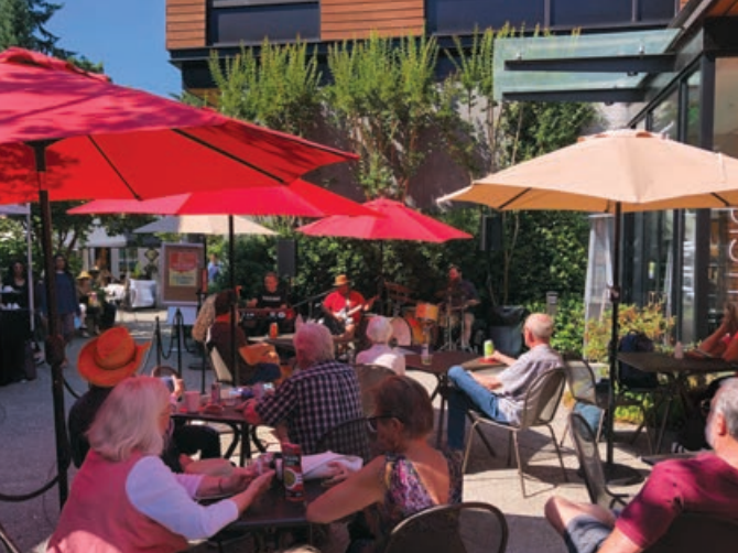
Visitors enjoying a performance by the Chebon Tiger Band during the Summer Art Market.