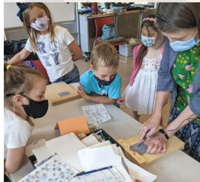
BIMA summer campers learn to cut linoleum for an art project.