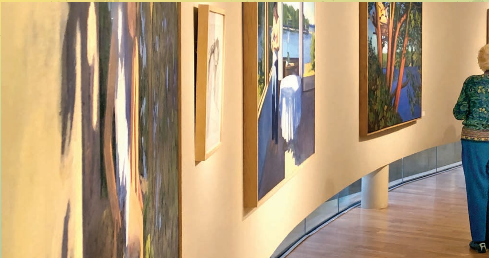
Participants in BIMA's Creative Aging program "Look Again" come together in Kurt Solmssen's exhibition The Yellow Boat .